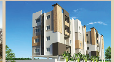
Tamara (Total 16 Flats) Karimnagar