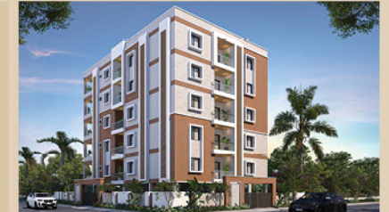
Amaara (Total 10 Flats) Karimnagar