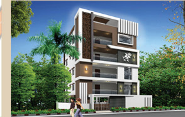
Fortune (Total 4 Flats) Karimnagar