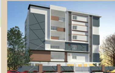
Flora (Total 5 Flats) Kompally