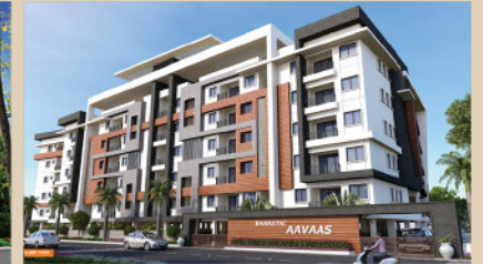
Aavaas (Total 75 Flats) Kompally