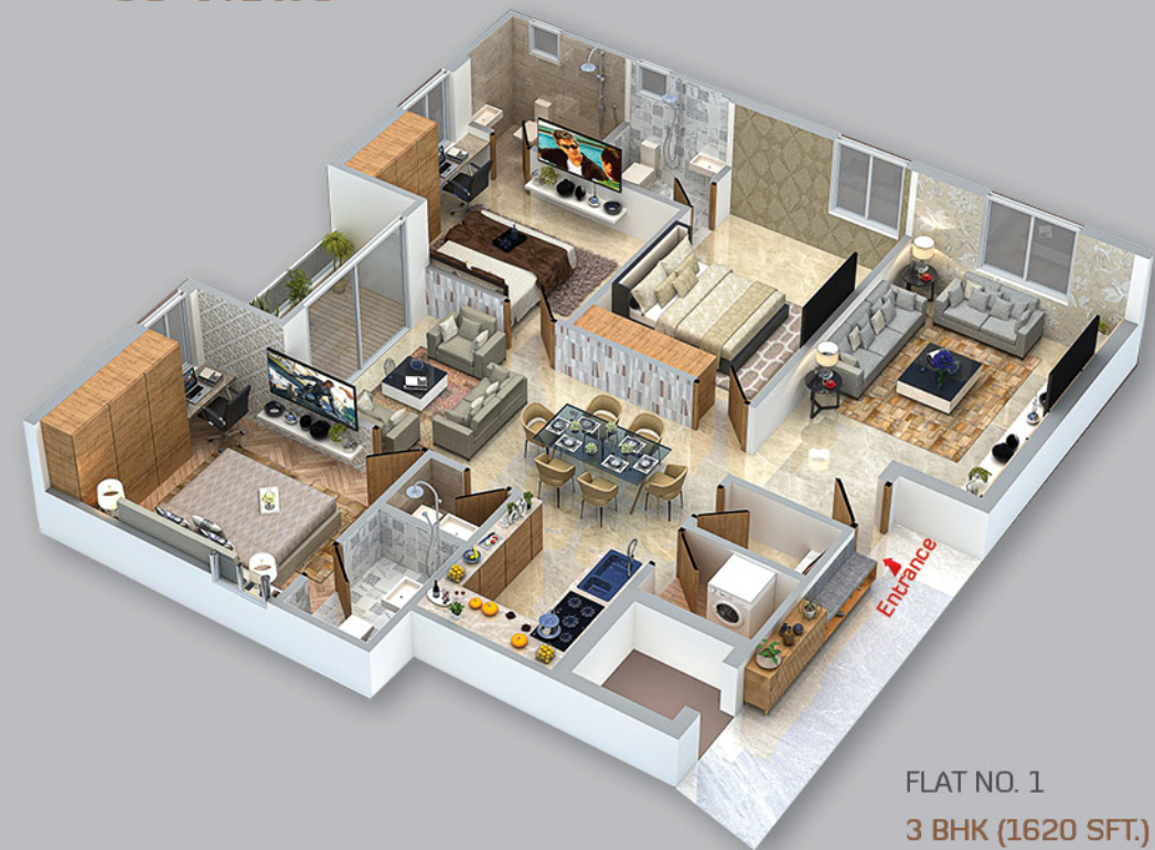
FLAT NO. 1 3 BHK (1620 SFT.) EAST-FACING