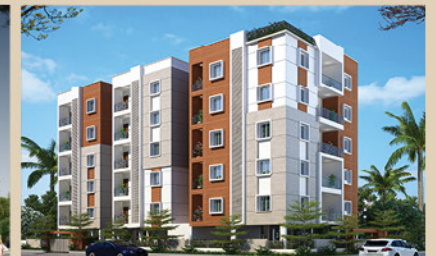
Aavaas (Total 15 Flats) Karimnagar