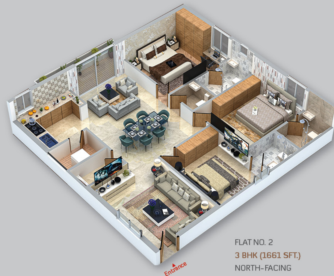
FLAT NO. 2 3 BHK (1661 SFT.) NORTH-FACING