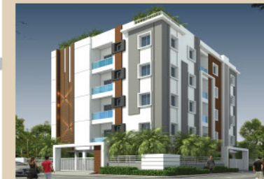
Exotica (Total 8 Flats) Karimnagar